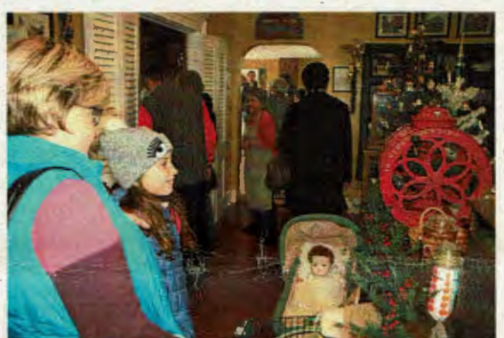
The General Store in the Welcome Center of the Park was all decked out for Christmas and filled with visitors.