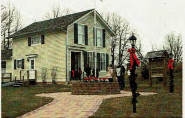
The Welcome Center "Dressed" for Christmas