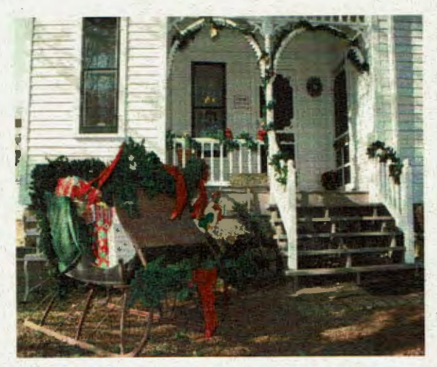
The Mill House "Dressed Up" For Christmas

During our Christmas at the Mill event, the ladies of the Society busy themselves in the days and weeks leading up to our Christmas celebration with baking beautifully decorated cookies and candies that we share with our guests. A big treat is having one of the ladies of the Society fire up the wood-burning kitchen oven and bake a few