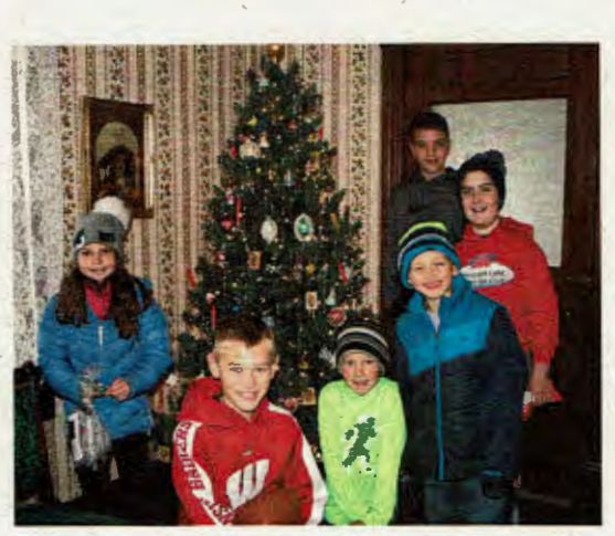
"We found the pickle ornament!" – Children were invited to experience an old German custom.