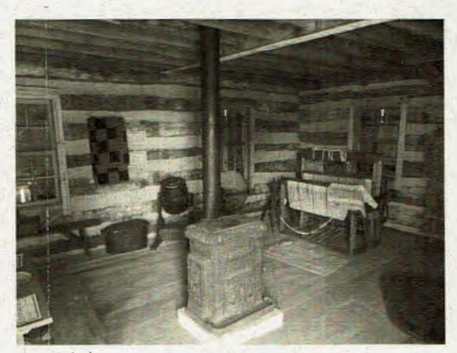
The Motz Cabin

Our newly dedicated Blacksmith Shop will be another great venue for visitors young and old. It is a vast improvement from past years when blacksmithing demonstrations were done under a shade tree. Now we have a wonderful building with room to display our collection of tools of the trade. As with all of our attractions, the Blacksmith Shop will require repeated visits to see everything.