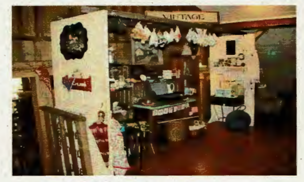
Antique Dealer's Booth

There is space for booths at which dealers will display and sell their lovely vintage, pre 1970 collectables and art objects. You may find just the piece that will bring added beauty to your décor.