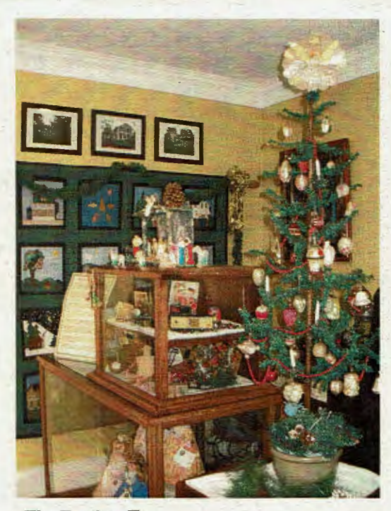
The Feather Tree